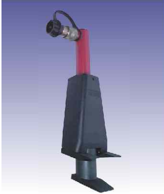
▲ HS10K Hydraulic Model

With the Hydraulic Power-Spreader, HS10K, a hydraulic cylinder replaces the ratchet handle. A standard hand pump powers 1 Power-Spreader, or a pair, with ease. Again, you are supplied with 4535 kg (10,000 lbs) of force and 76.2 mm (3") of gap; ample for gasket replacement or turning of blinds.