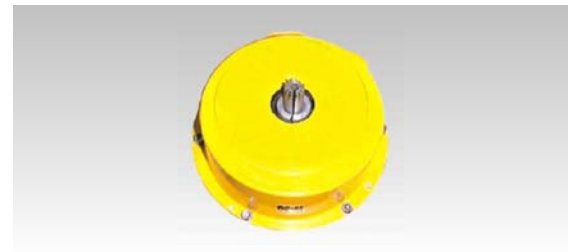
SPRING ASSEMBLY CONTAINER