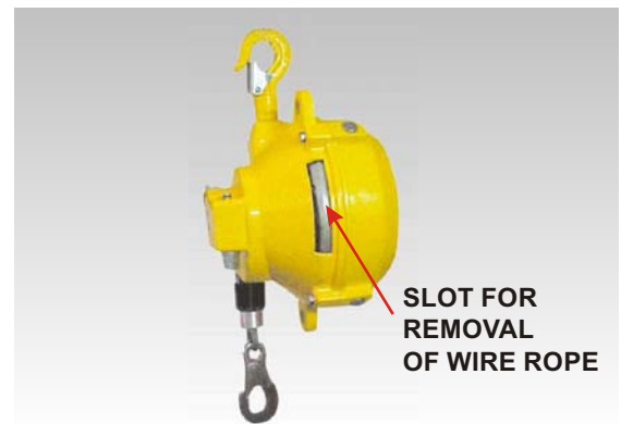
SLOT FOR REMOVAL OF WIRE ROPE