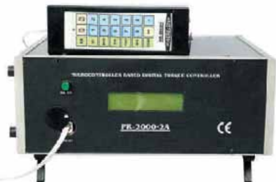
PR-2000 - EXTERNAL PRINTER

1. PR-2000 Series , with microprocessor control, built in printer and computer connectivity to download and study expansion values. Ability to generate 10 report formats for quality control of expanded joints. Operates with a remote control.