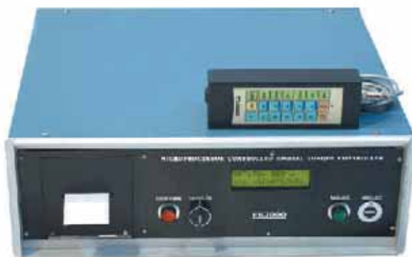
PR-2000 - BUILT IN PRINTER